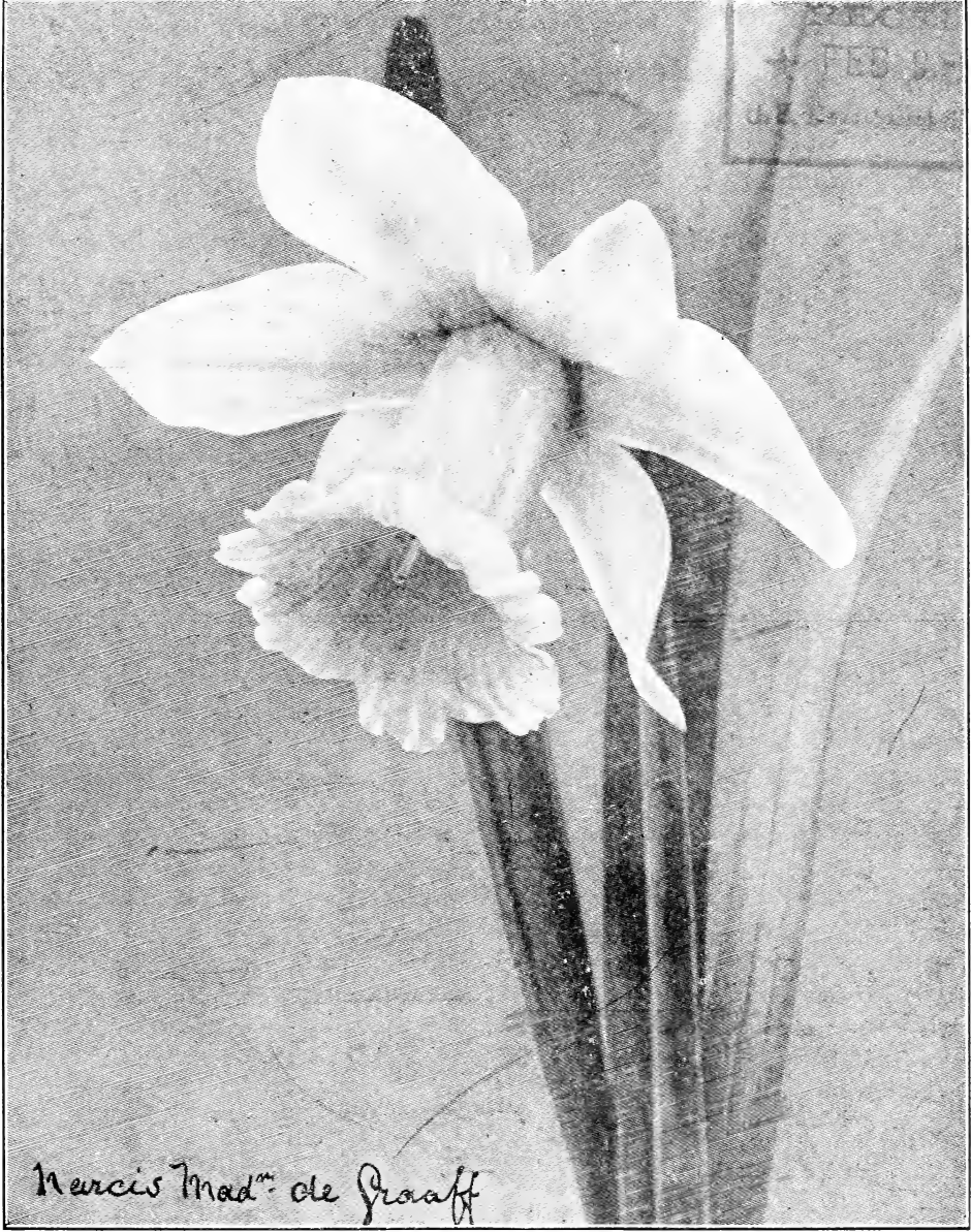
Narcissus Mad m de Graaff